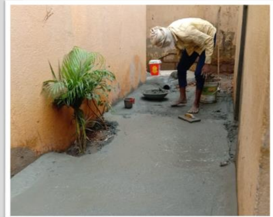
Toilet Room Repair @ Gollahalli Govt. School