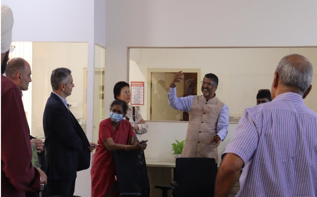
Delegates from Barcelona