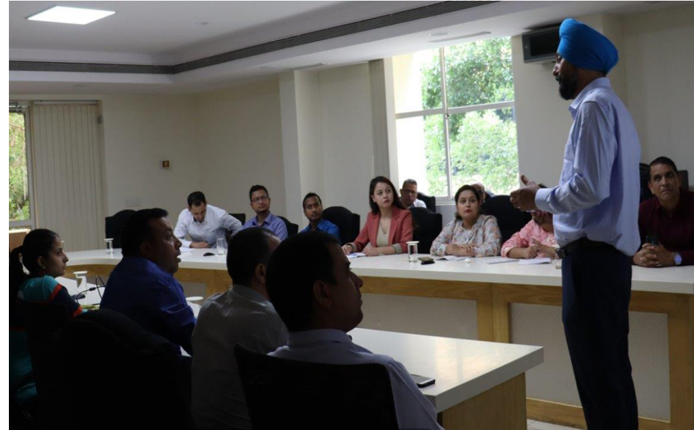
Delegates from Nepal