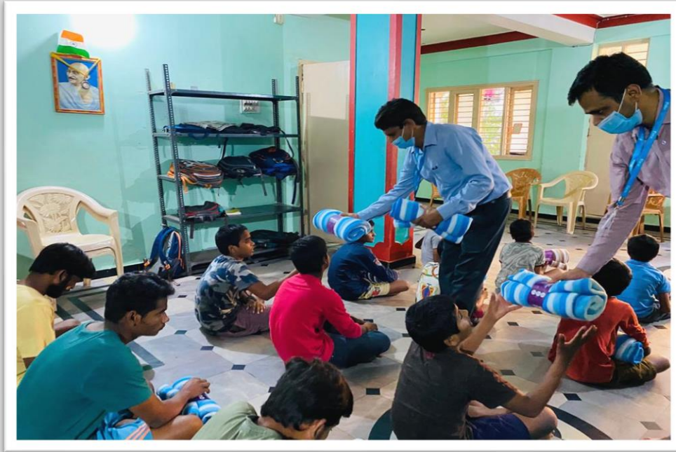
Distribution of blankets and stationery for Gollahalli Govt. School