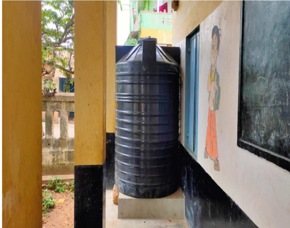
Water tank @ Chikathogur