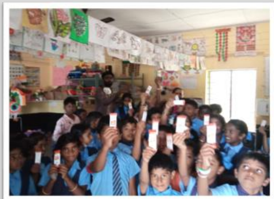
Distribution of Peanut Chikkis to 6000 children on behalf of 'Azadi ki Amruth Mahotsav'.