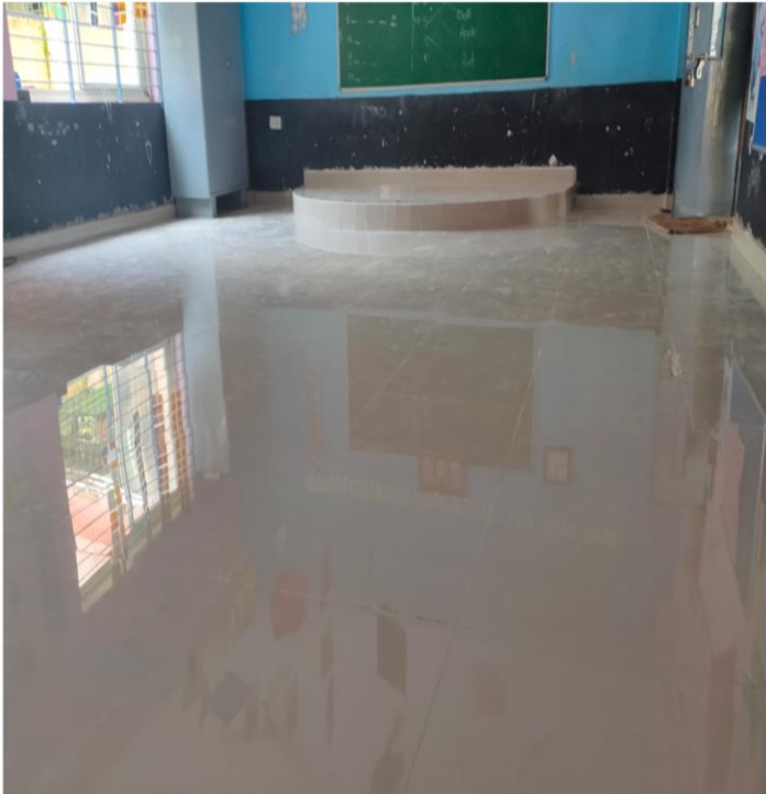
New flooring @ Konapanna agrahara Govt School