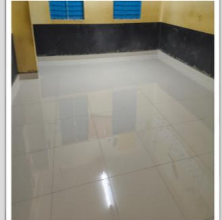
New flooring @ Gollahali