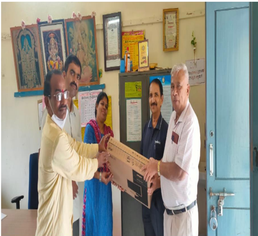
Donation of computer and printer to Central Jail School